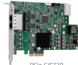
PCIe-GIE72P PCIe-GIE72P PRO

2/4-CH PCI Express® GigE Vision PoE+ Frame Grabbers with PoE Power Management & Protection, ToE and Software License Management